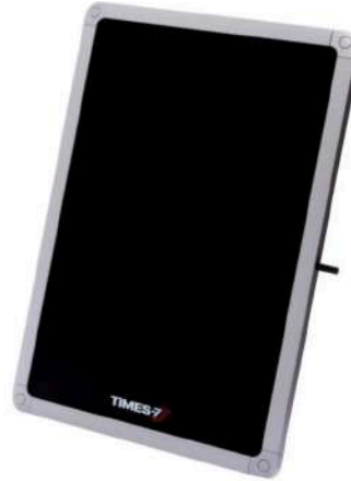
The SlimLine A6032

Proven in a diverse & growing range of markets, applications include: retail & customer interaction, conference & people tracking, race timing, baggage handling, and logistic & supply chain asset management.